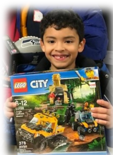
New toy, Happy Boy!

in a row, collected a host of beautiful toys from their customers. These 400+ generous gifts ranged from stuffed animals, dolls and games to bicycles, scooters and small electronics. So much excitement was in the air as these toys were distributed! Our grateful thanks to the management and customers of Chopsticks of Edmonds!